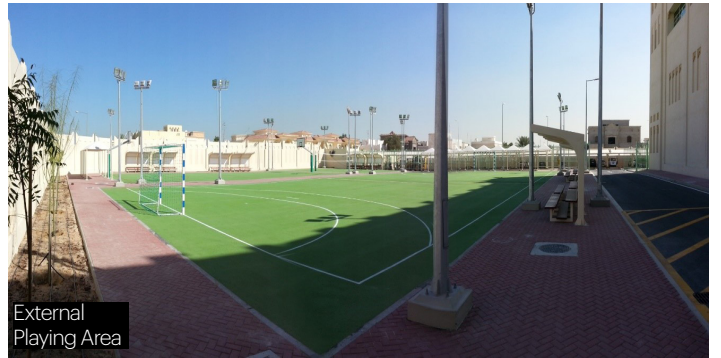
External Playing Area