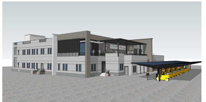
Expansion of the Suez Canal Container Terminal in Port Said